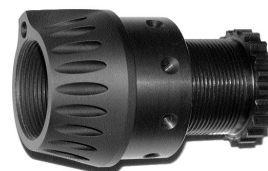
Extension nut shown with barrel retainer lock nut started

4. After the thread locker is set, slip the barrel extension piece into the receiver barrel collar. Make sure the extension piece pin is securely in the 12" locator notch in the receiver barrel collar. Apply a coating of anti-seize compound onto the threads of the barrel retainer nut. Failing to do so may cause the threads to gall and lock the two nuts together, ruining the aluminum receiver extension nut. Slide the steel barrel lock nut over the barrel, and turn it by hand until it stops against the extension piece flange. Then, using a standard armorer's wrench, apply 50 to 80 foot-pounds of torque as necessary to align the lock nut to the gas tube channel.